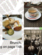
Brunch, Starting on page 148